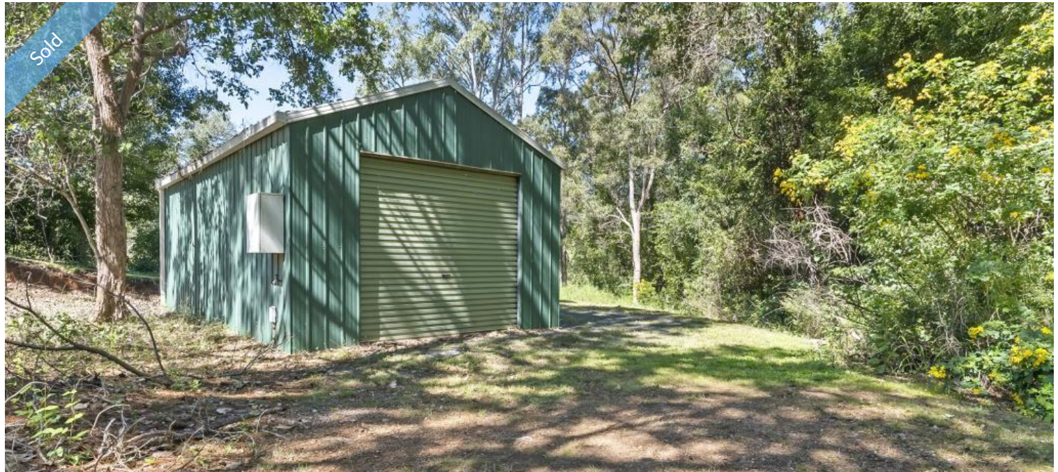
Lot 4 Stephens Street, Kandanga