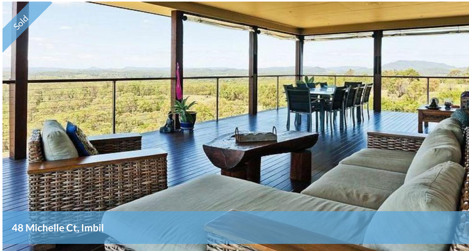
48 Michelle Ct, Imbil