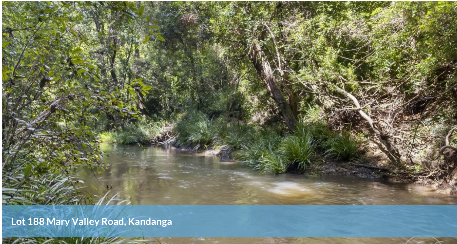
Lot 188 Mary Valley Road, Kandanga