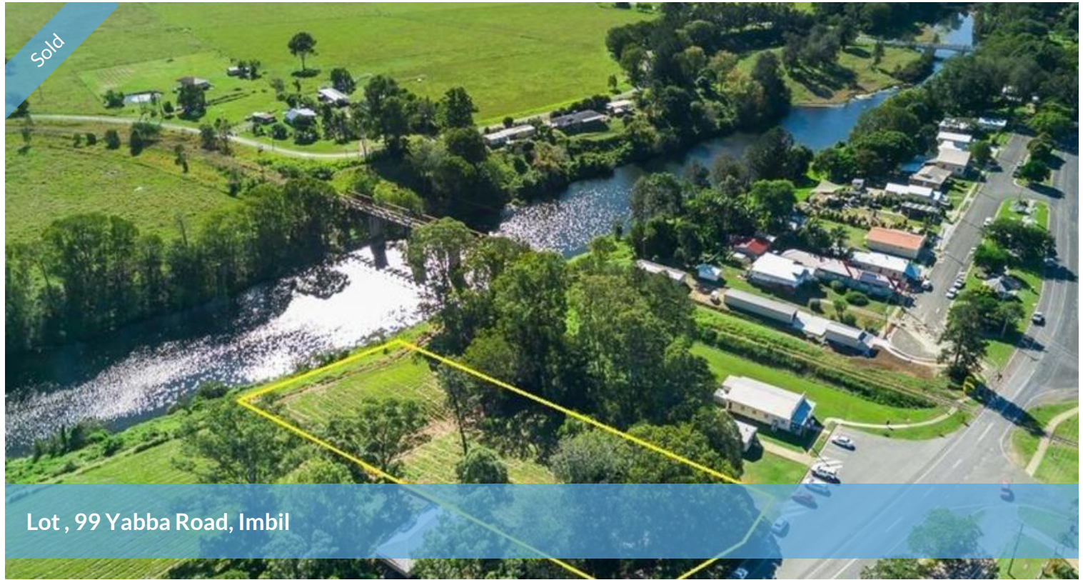
Lot , 99 Yabba Road, Imbil